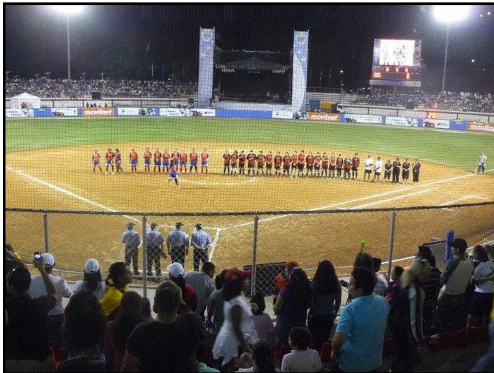
White Sox vs. Venezuela – Walk Out. Capacity crowd of 5000 Venezuelan Softball Fans