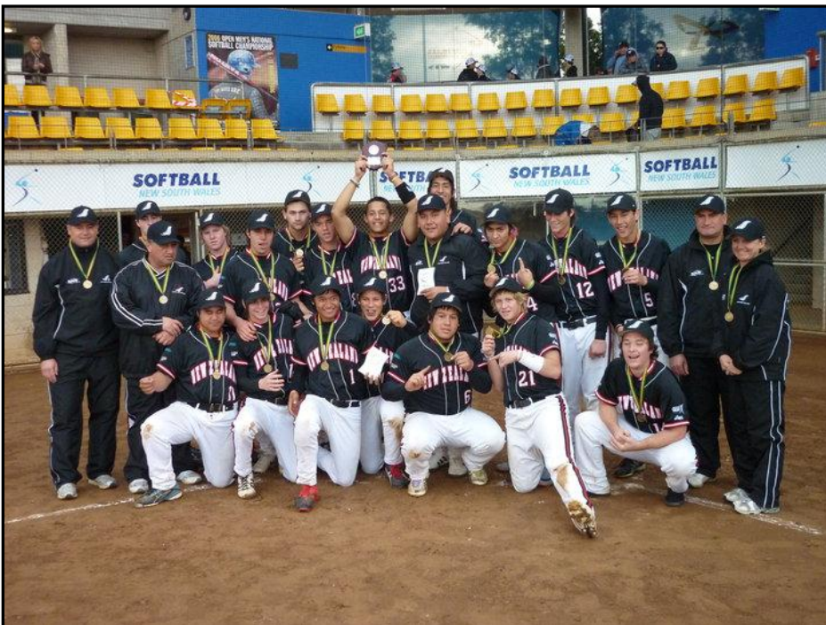
Below: Junior Black Sox Infield.