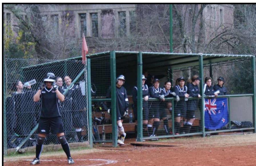
White Sox dugout during a late afternoon game vs. Argentina