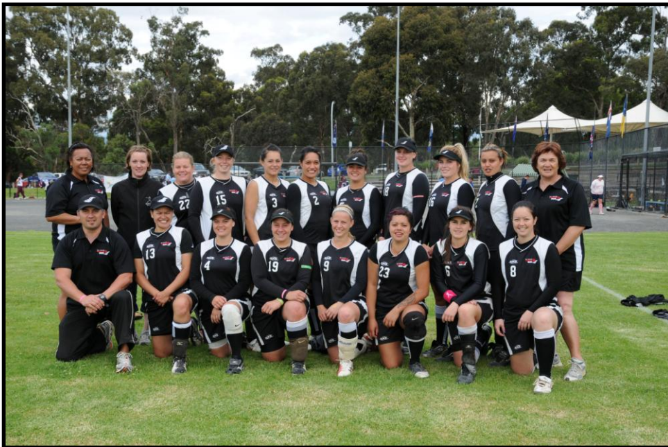
Above: New Zealand White Sox Melbourne Weber-Edebone Team