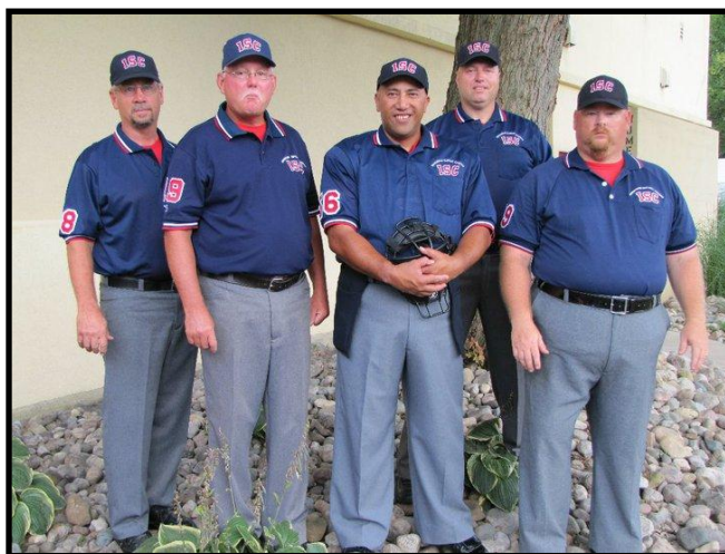
ISC World Tournament finals crew, Midland, Michigan USA. 21 August 2010.