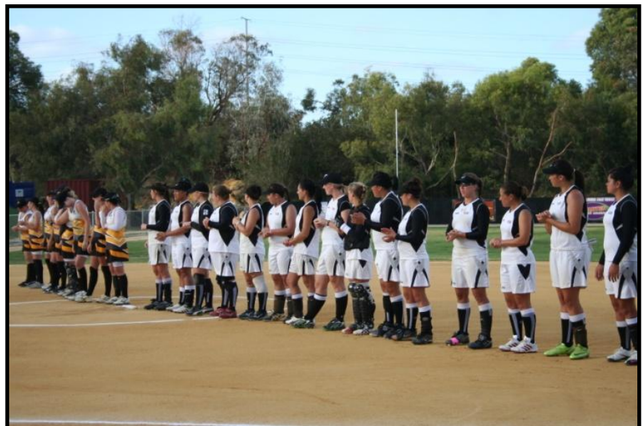
Below Team naming prior to WA Flames game.