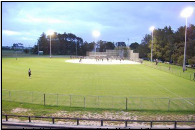
North Harbour's Rosedale Park - Number 1 Diamond