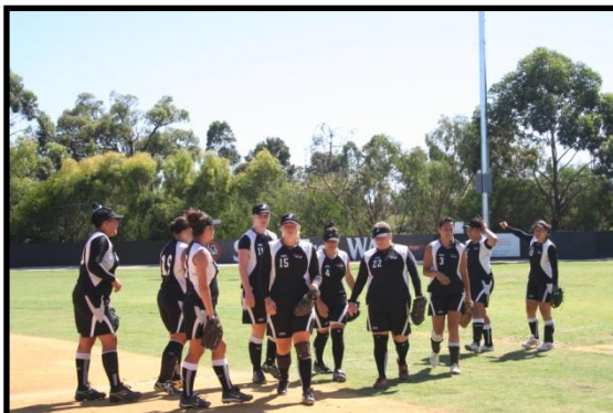
Bottom Left Pre Game Prep