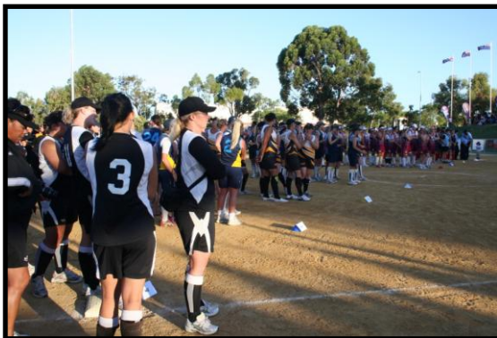
Top Left Weber – Edebone Closing Ceremony